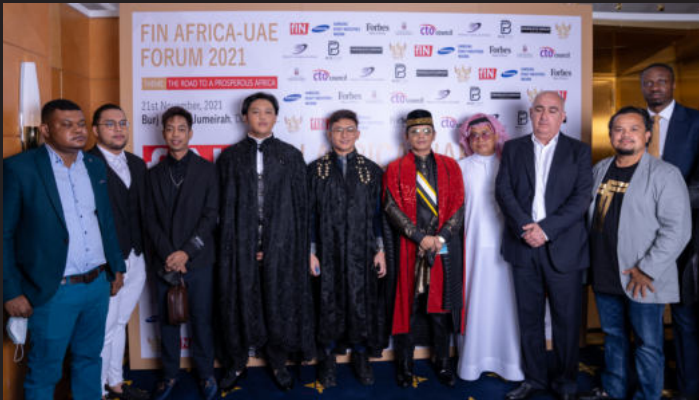
FIN Africa-UAE Forum, Dubai 2021