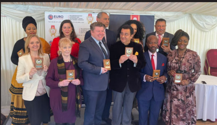
Euroknowledge Leadership and Philanthropy Forum and Awards Ceremony, K 2022