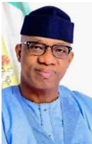
HIS EXCELLENCY DR. PRINCE DAPO ABIODUN MFR

Born on 21 March 1984 at JamesTown, Accra, he grew up with a passion for Entrepreneurship and he is an Accountant by profession trained by ACCA.