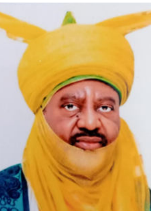
HIGH HIGHNESS AMINU ADO BAYERO, CFR (EMIR OF KANO, NIGERIA)

He has an honours degree in Classics and English